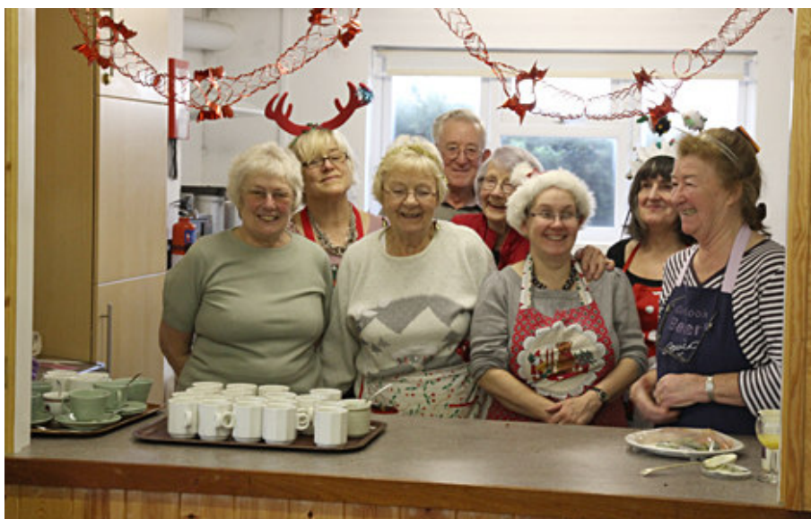
The wonderful cooks and helpers!