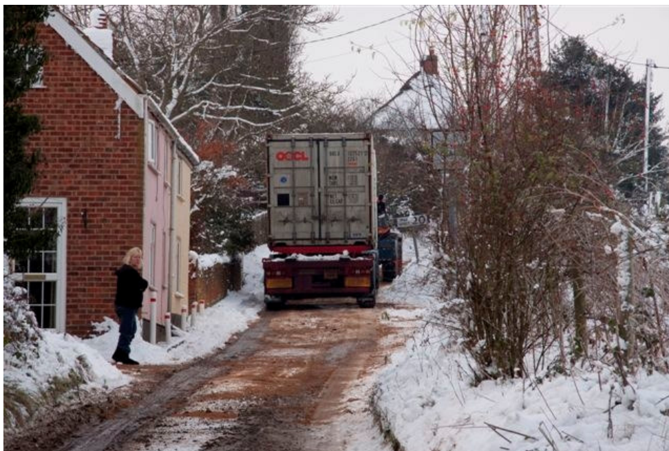
(Church Lane, Levington)

On the 20 th December a driver of a container lorry decided he would take a short cut and use our back roads (perhaps he thought Operation Stack was on but it wasn't!). However, he came to an undignified halt causing Church Lane/Stratton Hall Drift to be completely blocked as his vehicle got stuck near Levington Hall trying to get up the hill on an icy road. The police had to close the area for some considerable time as the road needed gritting and the lorry required specialist removal to get it on the move again.