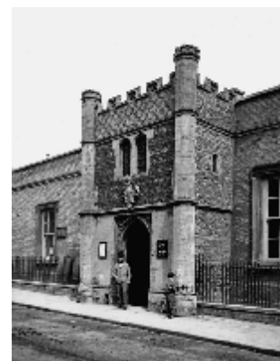
The Guildhall

In September 2009 as part of an annual national celebration of England's cultural and architectural heritage, Heritage Open Days were again staged in Bury St Edmunds. The event is coordinated by the Civic Trust and involves the opening of interesting buildings, some of which are not normally open to the public. The Town Council was proud to play its part in this by charting the history of the town's governance which was displayed in the Guildhall, one of the town's oldest buildings.