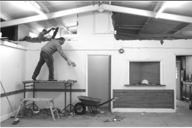
The Village Hall's internal walls have been made safe