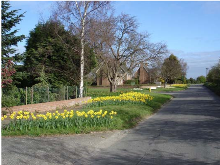
View of Bridge Road, Levington

Yes, Levington and Stratton Hall (as is Nacton) have been 'Street View' Googled and you can now see street level photos of all our local houses and roads to view on the internet.