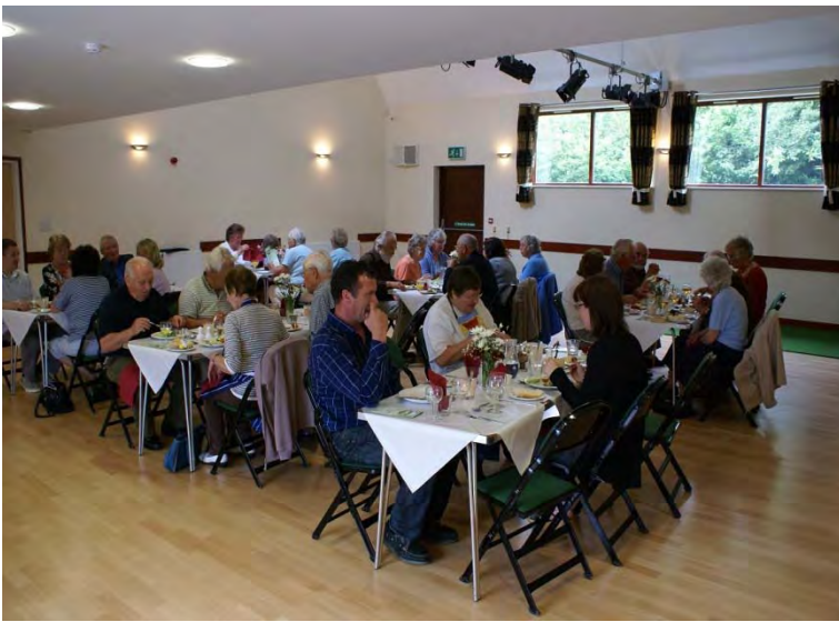
Occold Lunch Club.