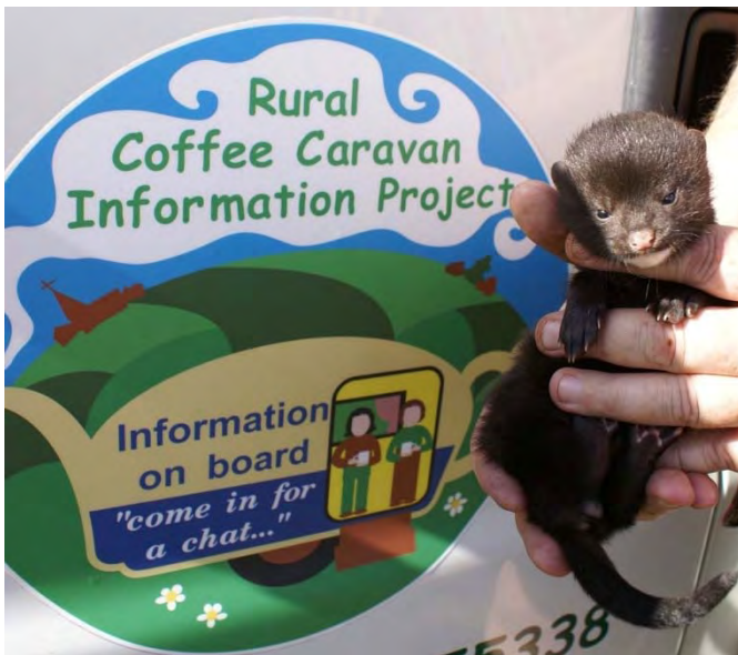
Above-An orphaned baby otter visits!

Above- This is a typical example of how the campervan can be used by lunch clubs etc. By joining events such as this, we operate all through the winter. We can do a 10 minute talk to those attending, pointing out certain services and new literature (as we try to update our leaflets regularly) and spend time chatting to individuals.