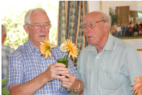
Serious business this judging lark! The two judges