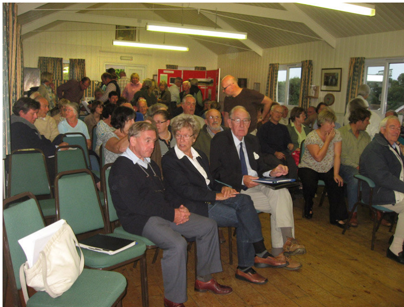
[The Village Hall starting to fill up for the open village meeting]

A village meeting was arranged for 17 th August in the Village Hall to hear resident's views. It was called because these were the first planning applications for wind turbines in the village and were planned to be sited within and close to the protected Area of Outstanding Natural Beauty (ANOB). They would also be in close proximity to each other and seen by several dwellings and local businesses.